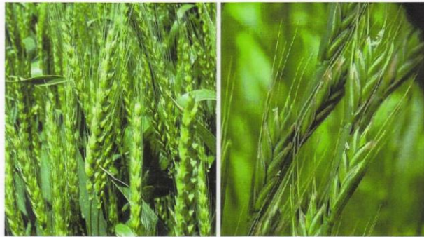
WHEAT: before it is fully ripe.