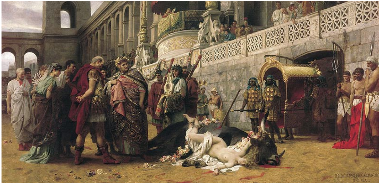
A Christian Dirce, by Henryk Siemiradzki. A Christian woman is martyred under Nero in this re-enactment of the myth of Dirce (painting by Henryk Siemiradzki, 1897, National Museum, Warsaw).

The persecution of Christians is religious persecution that Christians sometimes undergo as a consequence of professing their faith, both historically and in the current era. In the two thousand years of the Christian faith, about 70 million believers have been killed for their faith, of whom 45.5 million or 65% were in the twentieth century according to "The New Persecuted" ("I Nuovi Perseguitati").[4] 200 million Christians are persecuted in the world, especially in Arabia and parts of Asia.